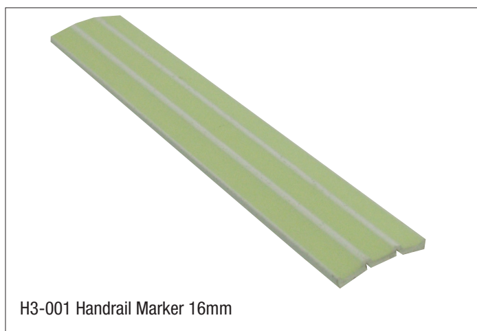
H3-001 Handrail Marker 16mm